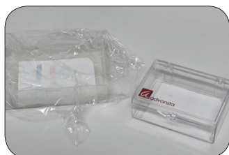
Save antibody and buffer by using the smallest tray that can hold your blot