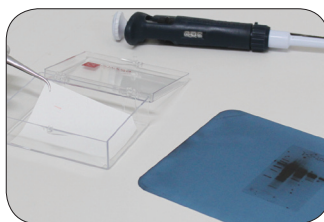
Beautiful Western blots every time